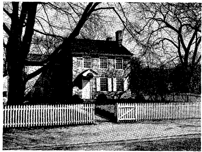
WASHINGTON'S HEADQUARTERS — This Valley Forge house will be visited by wives of members of the American Oil Chemists' Society during the fall meeting in Philadelphia, October 10-12.